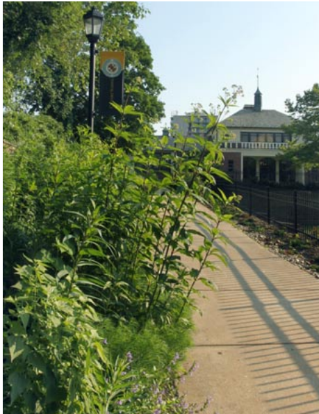
Monarch Waystation —Flowers that attract butterflies are planted along the path between Calvert's two classroom buildings.

The monarch butterfly is one of the most known and popular butterflies. Its beauty and movement are captivating, and might be the reasons for its popularity. But there's more to