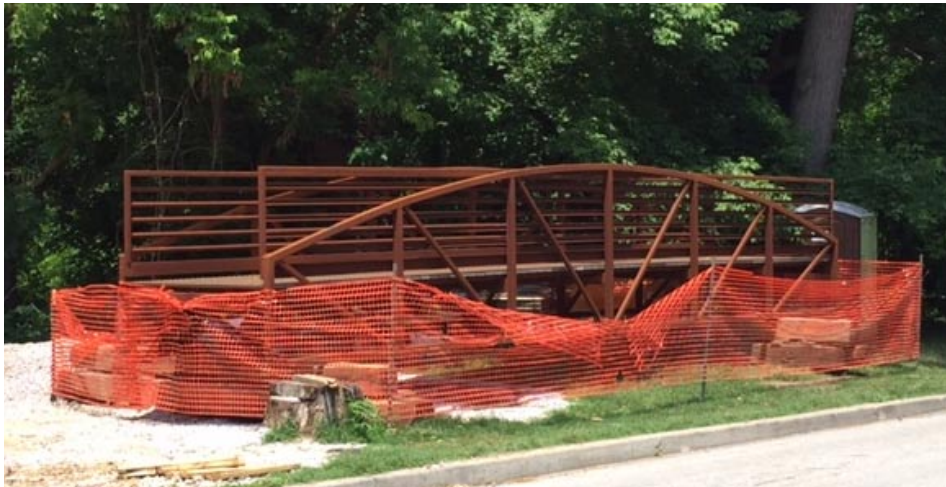
Bridge Delivery —Two new bridges for the Stony Run Walking Path are being installed this summer, after being fabricated off-site. The bridges will enable pedestrians to cross the stream next to Linkwood Road. Work should be completed by autumn.