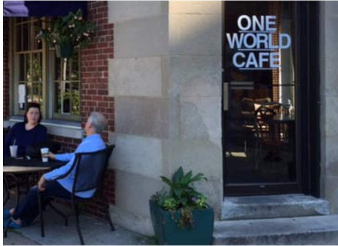
Al Fresco Dining —One World Café offers sidewalk seating.

The restaurant area in the back seats about 60 and can handle groups. The menu is extensive, with a detailed description of